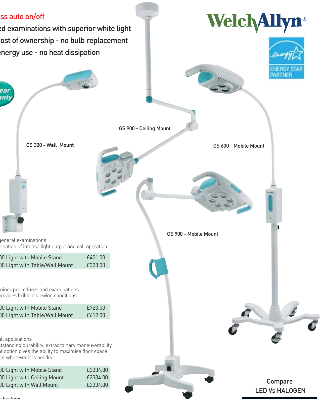
GS 300 - Wall Mount